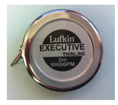
Figure 1a. Lufkin metal Tape measure