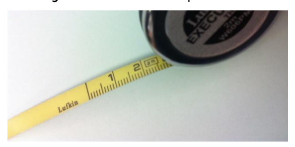
Figure 1b. Metal tape showing blank space before the zero mark

Where possible, make measurements on the non-dominant side. It is advantageous to have an assistant, who can help from the other side by checking the tape is always level and remains in the correct position.